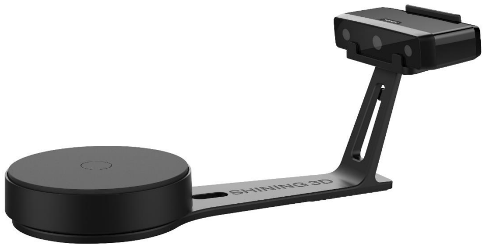
EinScan SP 3D Scanner